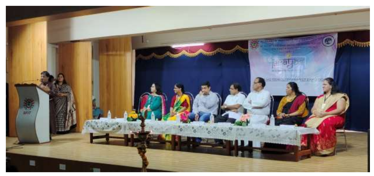
2. Inauguration Dignitaries